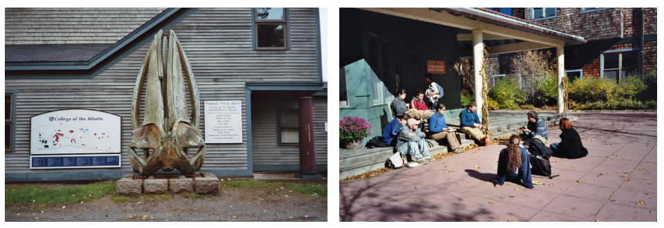
Prominent features of the COA curriculum are courses held with small groups in a seminar format, practical project orientation and community involvement. Nature experience also plays an important role.

Liberal arts colleges as well as study programs in human ecology are in Europe few and far between; the combination of liberal arts with human ecology is completely nonexistent. Yet we need such institutions urgently. Why?